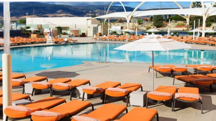
Reno January temperatures average 48°/30° but the heated pool and 101° hot tubs are a year round feature of this resort