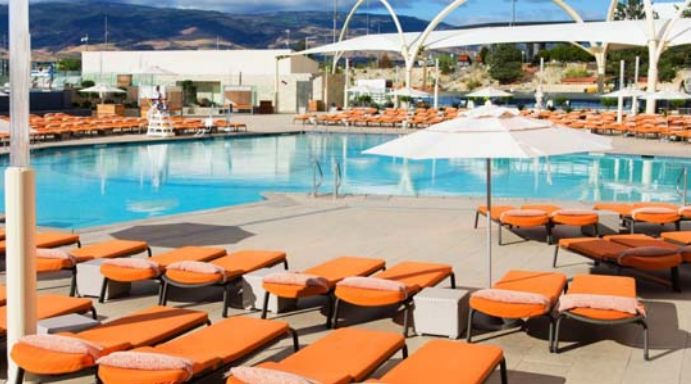
Reno January temperatures average 48°/30° but the heated pool and 101° hot tubs are a year round feature of this resort